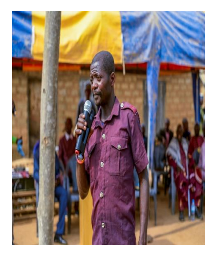
ONE OF THE SECURITY OFFICERS TESTIFYING OF DELIVERANCE FROM ADDICTIONS