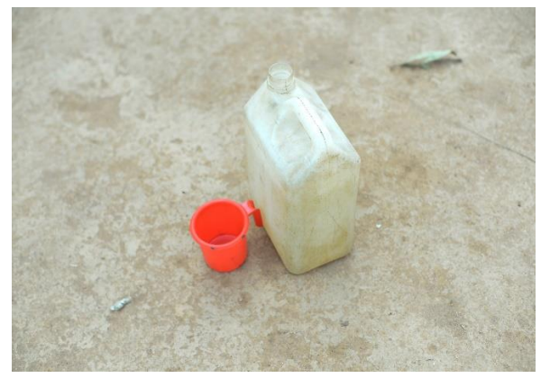
THE PEOPLE OF LIP HAVE WATER SCARCITY CRISES