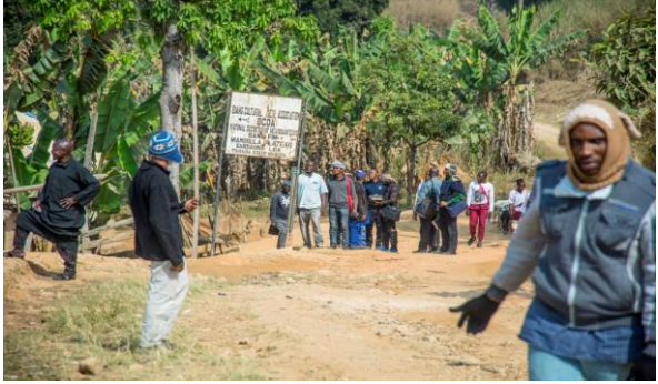
THE TEAM ARRIVES AT BANG COMMUNITY