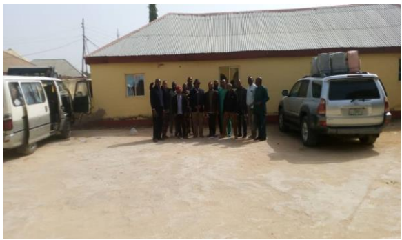
THE VEHICLES, LUGGAGE AND THE MISSION TEAM AT JALINGO, TARABA STATE.