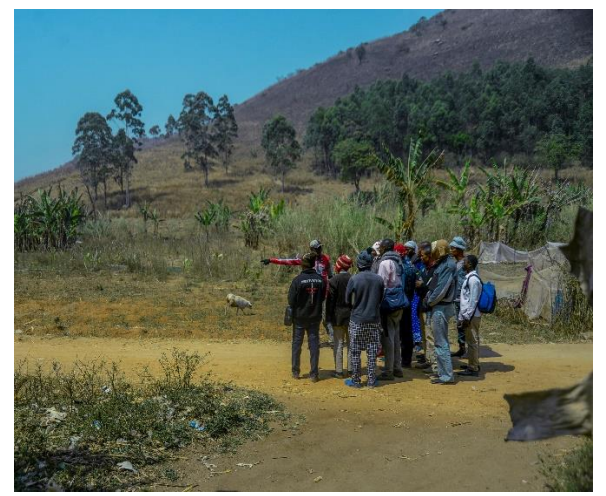
THE PROPOSED CHURCH SITE THAT IS TERMED "CURSED".