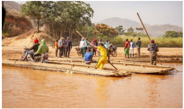
THE TEAM CROSSING THE WATERS TO BANG COMMUNITY