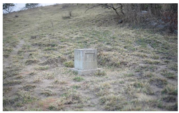
THE BOUNDARY STONE SEPARATING BANG AND CAMEROUN