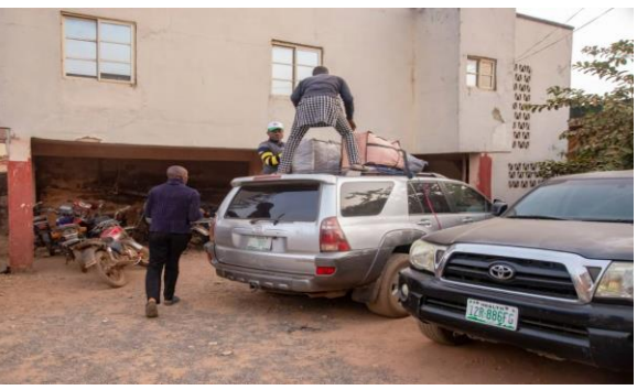
BRETHREN OFFLOADING THE LUGGAGE AT GEMBU, TARABA STATE

It was a journey full of experiences, one which God had ordained and as such, it was successful, but not without difficulties, most of which seemed humanly impossible to overcome. We never expected that we would scale through but God saw us through because he was the one that led us. When we trust in the Lord, He is obligated to give success in all things. Climbing the mountains to Bang community was a miracle.