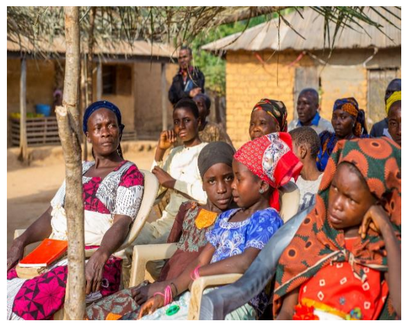
ATTENDEES AT THE CRUSADE GROUND