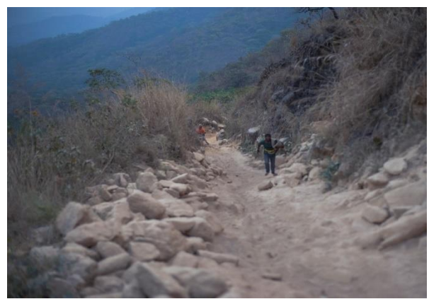
HIGHWAY FROM CAMEROUN TO BANG (A)