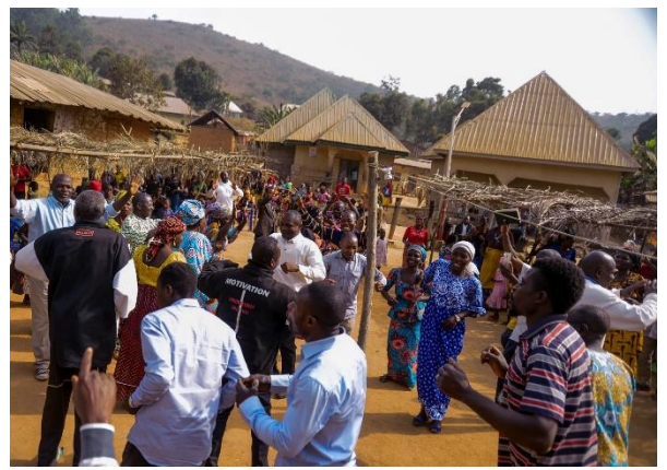
THE COMMUNITY DANCING UNTO THE LORD

In the end, there was a great celebration among the villagers, even among the Muslims.