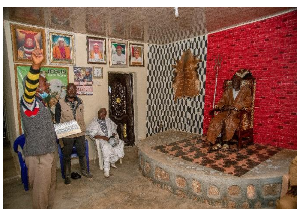
BROTHER NICE EXHORTING AT THE DISTRICT HEAD PALACE