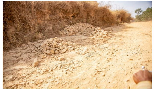
THE ROAD ON THE MOUNTAIN TO BANG