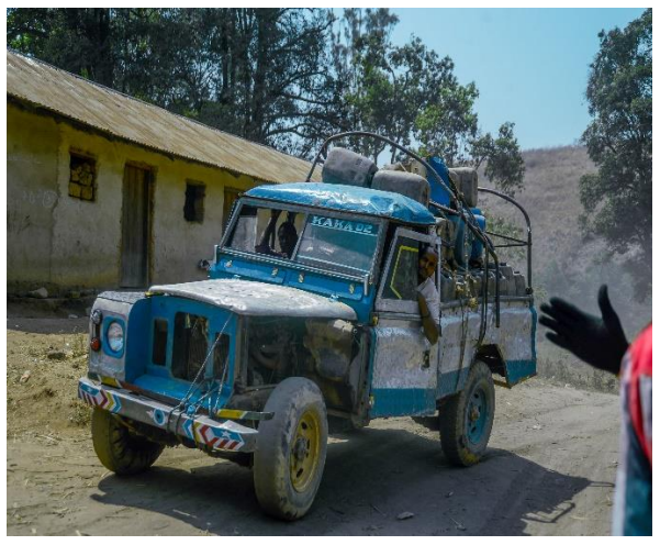
THE ONLY MOTORABLE MEANS OF TRANSPORTATION