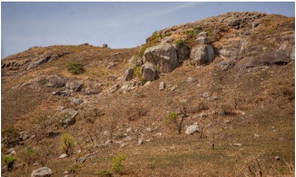
A MOUNTAIN AT BANG

It was a journey full of experiences, one which God had ordained and as such, it was successful, but not without difficulties, most of which seemed humanly impossible to overcome. We never expected that we would scale through but God saw us through because he was the one that led us. When we trust in the Lord, He is obligated to give success in all things. Climbing the mountains to Bang community was a miracle.